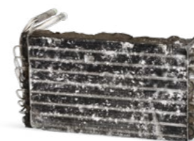
Without A/C maintenance