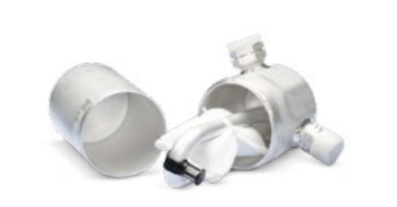
With A/C maintenance