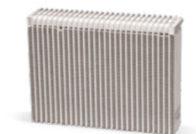
With A/C maintenance