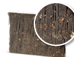
Without A/C maintenance